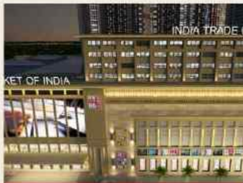
54L SQ.FT. BUILT-UP SPACE