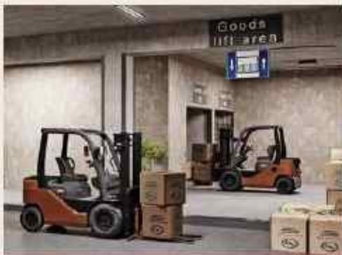
GOODS LIFT AREA