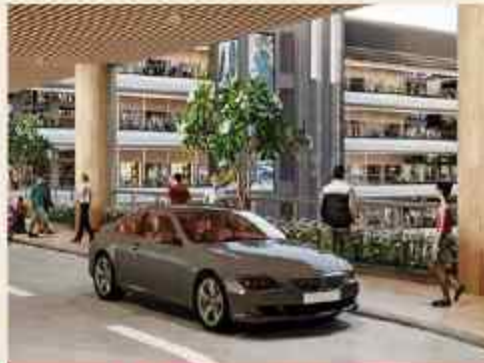
AIRPORT STYLE CONCOURSE RAMP