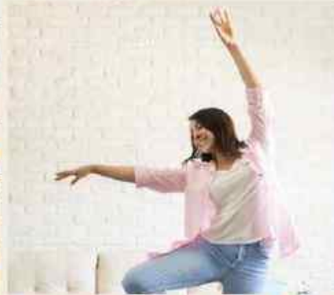
DANCE & MUSIC ROOM