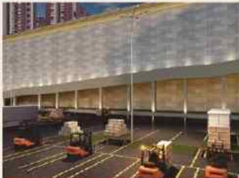
LOADING / UNLOADING BAY