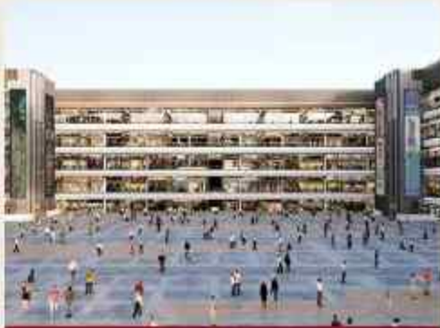
1.5 ACRE CENTRAL PLAZA